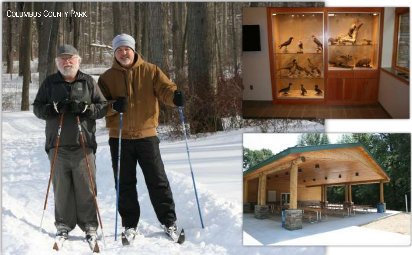
COLUMBUS COUNTY PARK

Through five separate transactions, the St. Clair County Parks and Recreation Commission (PARC) owns 411 acres of property in Columbus Township. PARC used a $65,800 Michigan Natural Resources Trust Fund (MNRTF) grant in 2016, to secure the final 26 acres. In 2007, PARC used a $1.4 million MNRTF grant to secure 291 acres for the park.