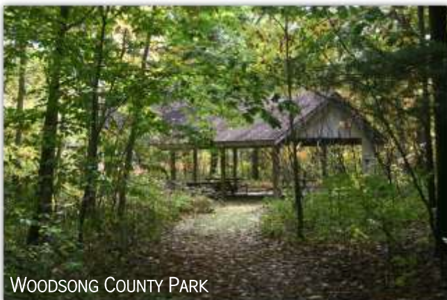
WOODSONG COUNTY PARK

The preservation and acquisition of land for outdoor recreational use is the highest priority in the County Master Recreation Plan. The purchase of Camp Woodsong allows the County to preserve it for continued outdoor recreation use, including nature study, hiking, biking, and water activities such as canoe, kayak and fishing access to the Black River.