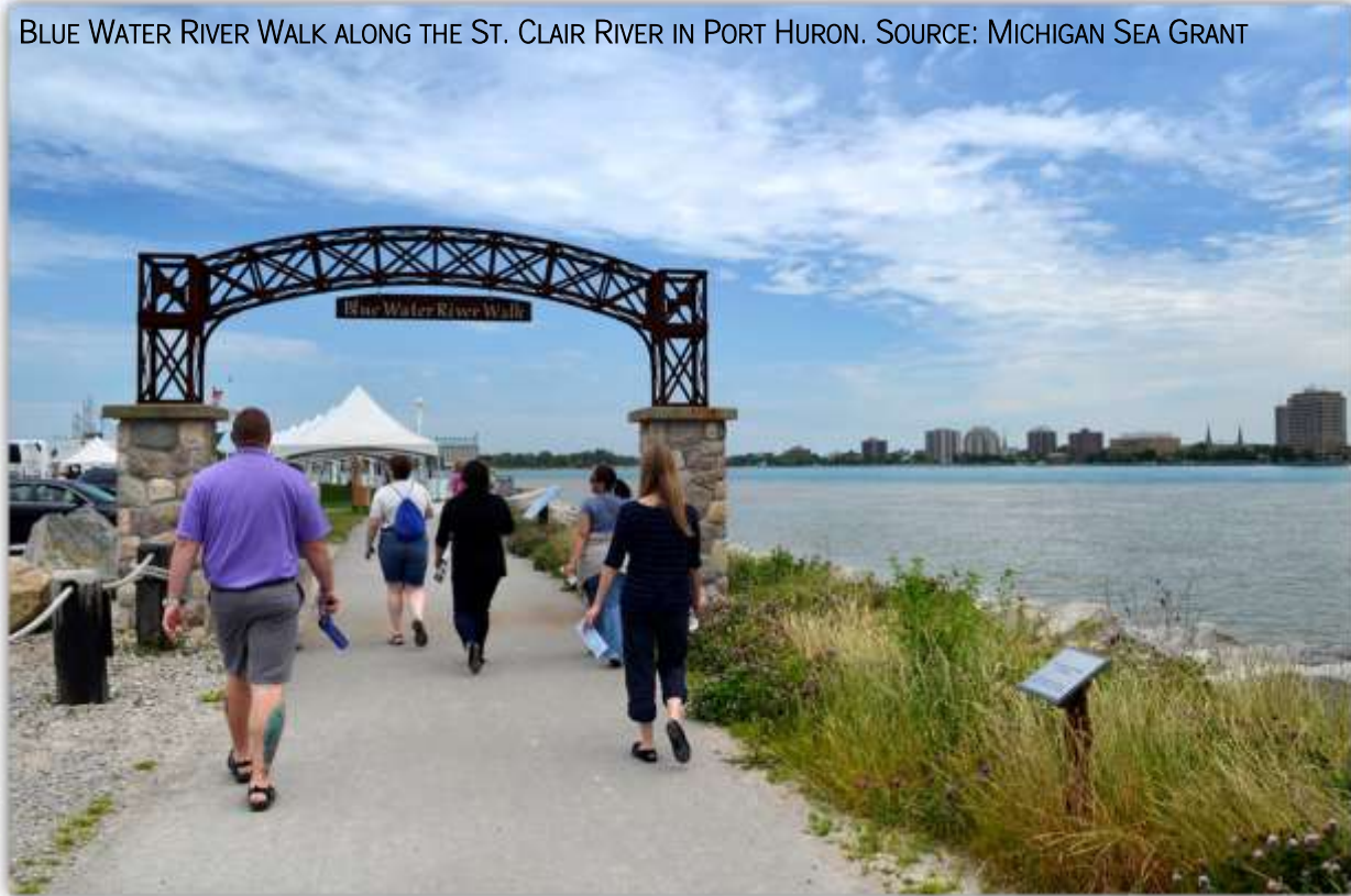
BLUE WATER RIVER WALK ALONG THE ST. CLAIR RIVER IN PORT HURON.

The St. Clair County Parks and Recreation Commission purchased 4.85 acres of land using two MNRTF grants and received a $1,039,500 grant from the National Fish and Wildlife Foundation to develop a 2.75-acre wetland on the very southern end of the river walk.