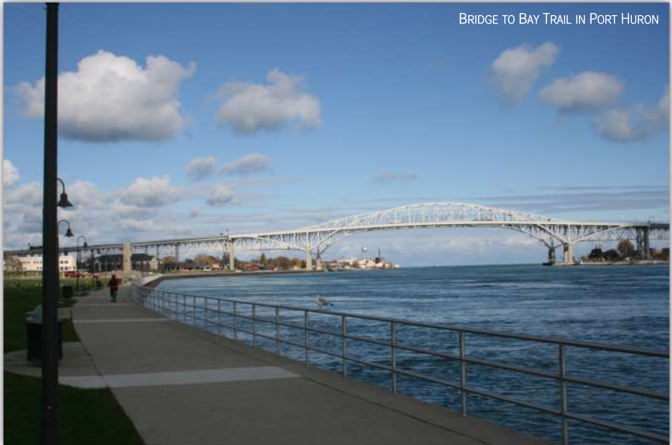
BRIDGE TO BAY TRAIL IN PORT HURON

to plan and promote the trail while each local unit of government is responsible for constructing their section of the trail. Even though PARC plays an instrumental coordinating role in the development of the Bridge to Bay Trail, the property that makes up that trail is owned by various municipalities and townships. Most trail construction projects are funded by grants. PARC usually helps to fund the local match required for trail construction grants.