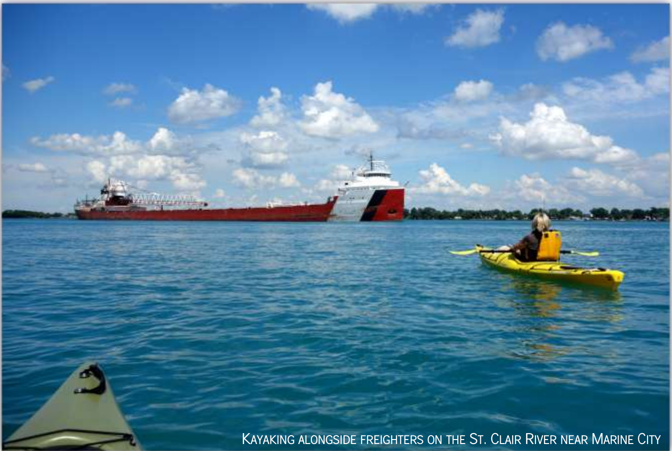
KAYAKING ALONGSIDE FREIGHTERS ON THE ST. CLAIR RIVER NEAR MARINE CITY

Michigan, the Thomas Edison Museum, the Huron Lightship Museum, and the Acheson Maritime Center. It also navigates between the United States and Canada for 2.5 miles and meanders through Fort Gratiot Township, Port Huron Township, and the City of Port Huron.